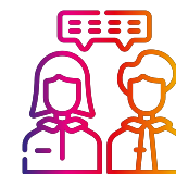
KNOWLEDGE SHARING ACTIVITIES