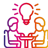
CAPACITY BUILDING FOR DIGITAL COMPETENCE CENTRES