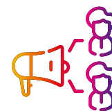
ADVOCACY CAMPAIGNS, POLICY DOCUMENTS AND EVENTS