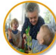
Together Old and Young